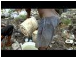
African Urban Issues (Click to View BBC Video)

accounts for 21% of world's output and Western Europe accounts for 20%; Africa's contribution to world's output is just 1%. Yet despite its low output ratio of 1%, Africa carries 17% of the world's external debt burden. The economic gap between the high-income economies and Sub-Saharan Africa has increased from being about thirty-two times in 1980 to becoming about seventy-six times by 2008.